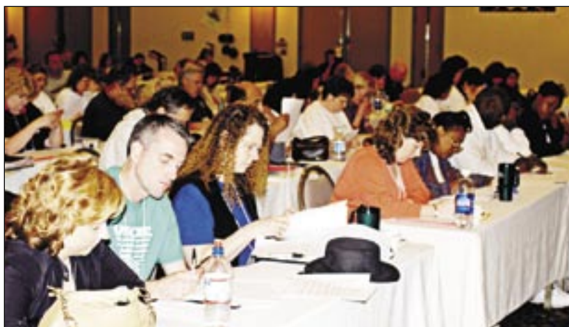
Convention delegates study a resolution before voting on it.