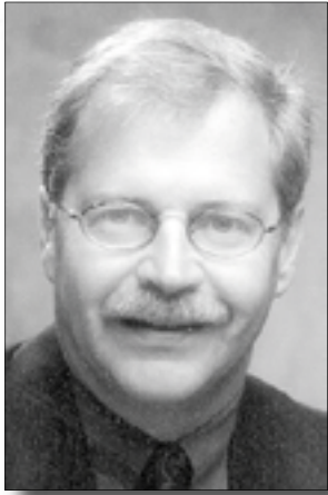
Letter from the President

B ush, borrow and spend. I guess I'm the problem.