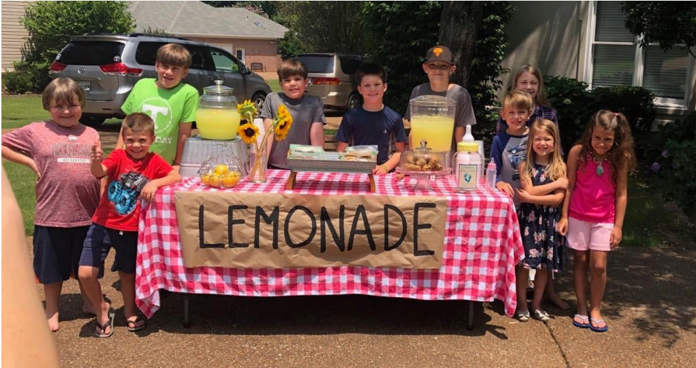
pictured above: children from the Fitts, Lagares, and Rasnic's families