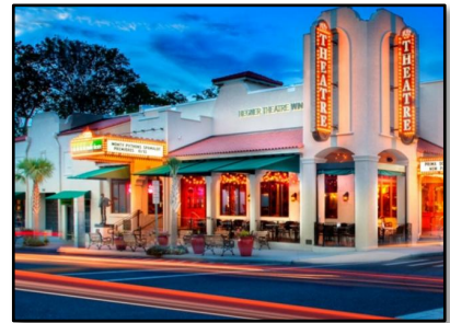
Florida Studio Theater

The Ringling Museum of Art boasts having one of the largest collections of Peter Paul Rubens paintings and a spectacular Circus display. There