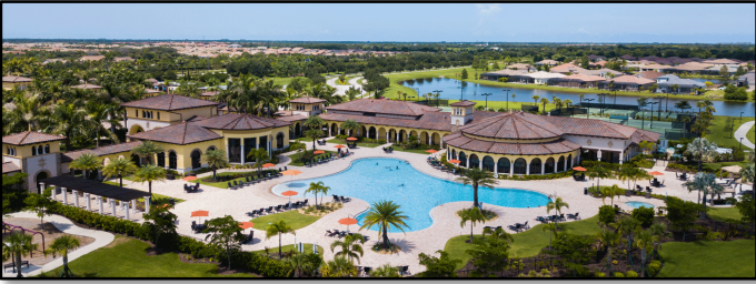
Gran Paradiso in the West Villages

Sarasota County is one of the fastest growing housing areas in the United States, spurred by new development in Venice and North Port. This development includes an area known as "West Villages," on Venice's southern border where there are plans for more than 20,000 homes.