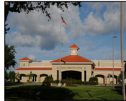
Venice Community Center

exhibition, enjoy an evening of live blues or jazz, listen to a mid-day lecture, or even sign up for a class on watercolors, pottery, or jewelry making.