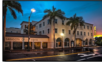
Sarasota Opera House

Ask anyone to describe life in Sarasota and it's likely you'll hear "arts and culture" in their very first sentence. Beyond being known for their beaches,