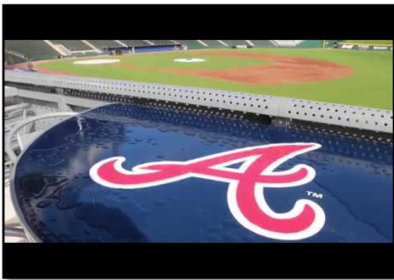
Cool Today Park – Spring Training Home of the Atlanta Braves

The new spring training facility for the Atlanta Braves celebrated their grand opening at the Cool Today Park with the final spring training baseball game in late March. Several community events will be held