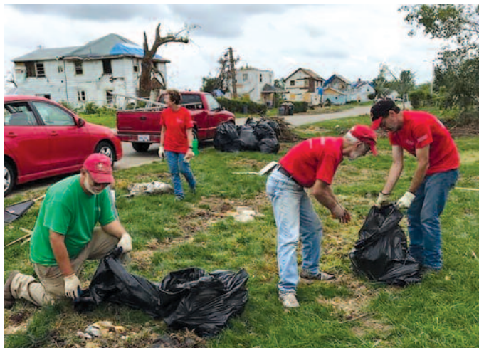
Volunteers cleaning up after Memorial Day tornadoes

New transportation to work projects coming soon, thanks to generous donations.