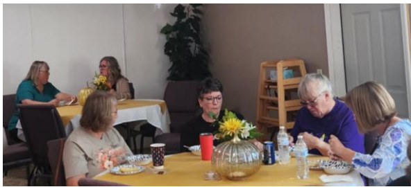
Some (not old) reunited Bible Quizzers. v