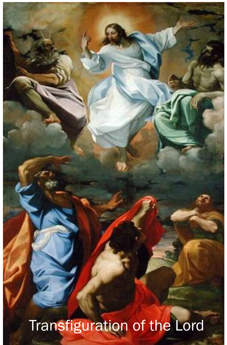
Transfiguration of the Lord

Parish Library; Please visit the parish library next to the church located in the elevator foyer. The library is open everyday and books are available for check out.