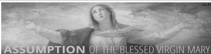
ASSUMPTION OF THE BLESSED VIRGIN MARY