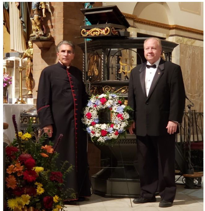
Thank you to the 4th degree Knights of Columbus Assembly for the Veterans Day Wreath that was donated to the parish.