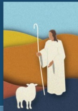
THE 99 EXPERIENCE

Join us for a Lenten Mission March 8th, 9th & 10th, 2020 St. Anthony Church, Des Moines