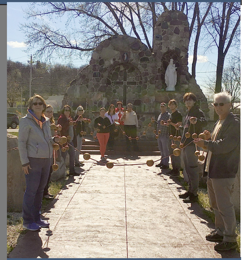
Divine Mercy Sunday at the Grotto 70' Rosary used to pray the Chaplet of Divine Mercy

Hours: <u>New Hours</u>: 8am—12pm Monday—Friday until further notice. Phone: 515.244.4709 Address: 15 Indianola Rd., Des Moines, IA 50315