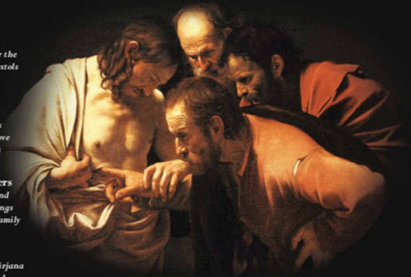
Doubting Thomas, Caravaggio, 1602-1603