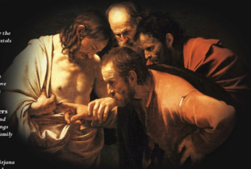
Doubting Thomas, Caravaggio, 1602-1603