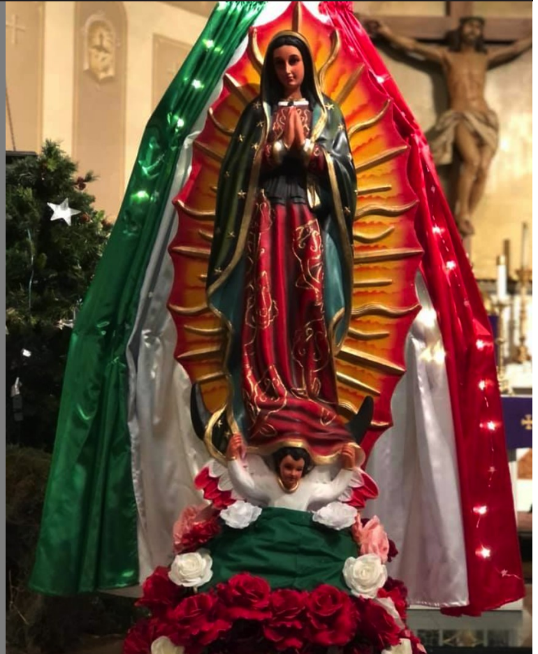
Our new Statue of Our Lady of Guadalupe

Address: 15 Indianola Rd., Des Moines, IA 50315