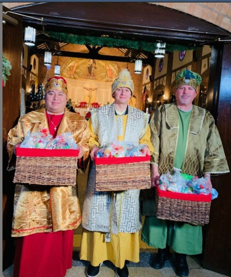
The Three Wise Men

Address: 15 Indianola Rd., Des Moines, IA 50315