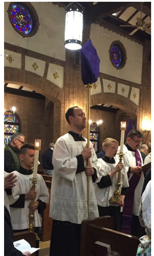
Stations of the Cross