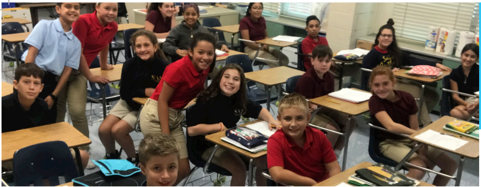
First Grade Spanish Immersion Class

Dear parishioners of St. Anthony Parish,