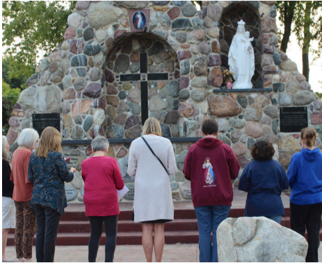
Patriotic Rosary at the Grotto

He was praying in a certain place, and when he had finished, one of his disciples said to him, "Lord, teach us to pray just as John taught his disciples." Luke 11:1