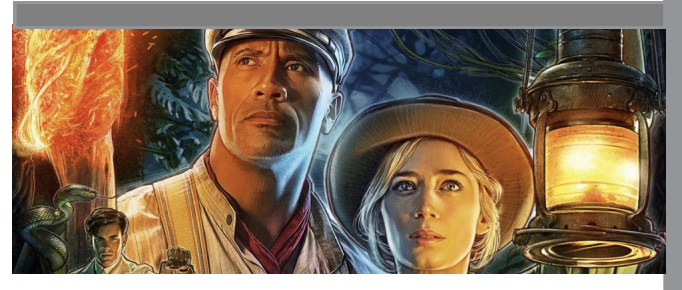
"The Jungle Cruise" Friday, May 13 / 7pm / Parish Hall $5

support the St. Anthony music program. A family friendly event! Cost to get in...donation. Be sure to bring your lawn chair.