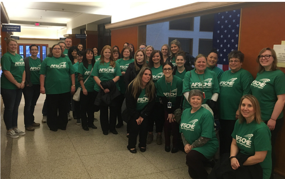
Local 1262, Cowlitz County Courthouse: Members arrived to work early to greet their County Commissioners during contract negotiations, show support for their negotiations team, and bring attention to contract proposals. The CBA was ratified by the Union last month.