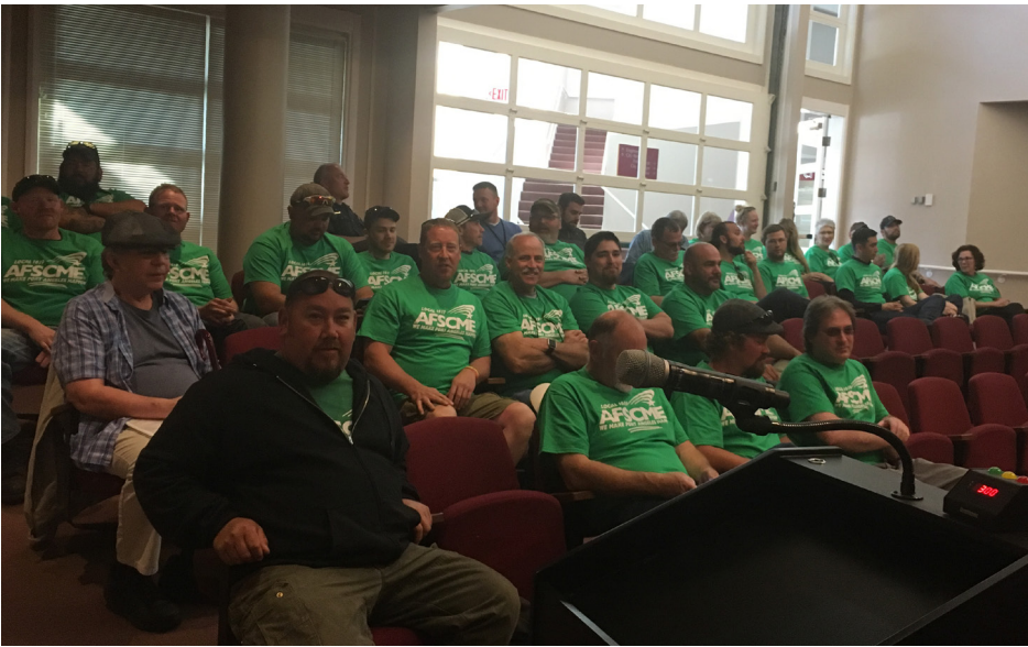
Local 1619, Port Angeles City Employees: Members attended and spoke at a City Council meeting to encourage support for fully funding the Union’s proposals for wage increases. Membership then ratified the CBA last October.