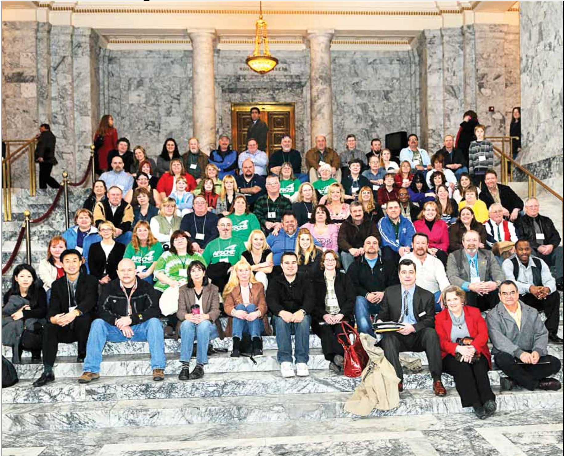
Council 2 members pose for a picture under the dome of the Washington State Capitol building during the Legislative Weekend held in Olympia in late January. See pages 1 and 2 for reports on the event.