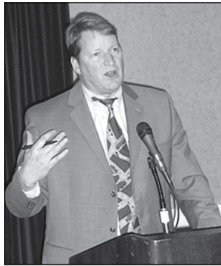
Sen. Craig Pridemore

Brace yourselves. It will be some time before the budget crisis facing the state improves.