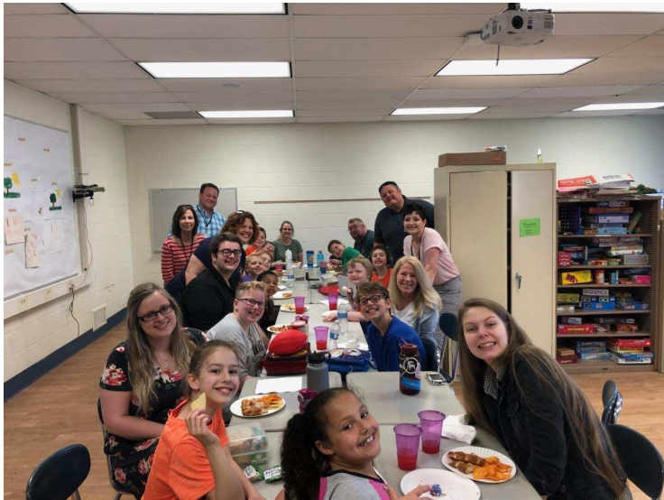
Kids Hope Year-end party!

***If you are currently a mentor and are not planning on being one next year, please let me know. Also, if you would like to be a mentor next year, also contact me so I can have an idea for next years training! Thank you!