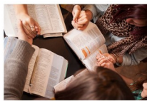
FATHER'S DAY JUNE 19TH

This Wednesday June 8 th will be "Our Hour of Power" for June, and then on June 19 th (Father's Day) we will have a time of prayer for women to pray for the men in their lives in between the services starting at about 10:15am.