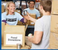
BRUNSWICK FOOD PANTRY

March's ministry of the month are the local food and personal care pantries in Brunswick.