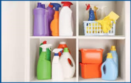
PERSONAL CARE PANTRY