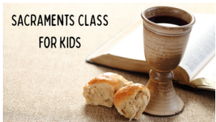
SACRAMENTS CLASS FOR KIDS