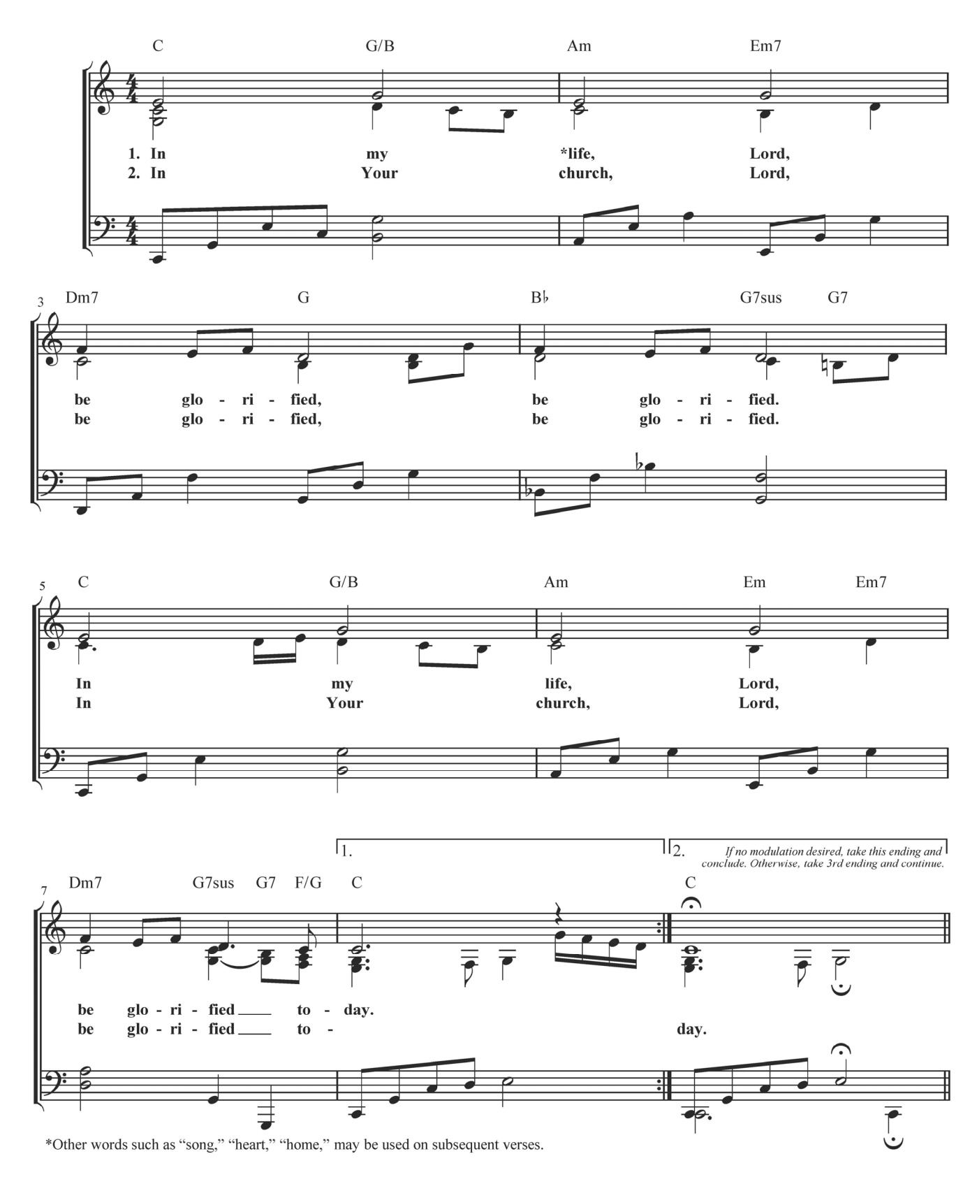
© Copyright 1978 Bob Kilpatrick Music, P.O. Box 2383, Fair Oaks, CA 95628 all Rights Reserved Used by Permission