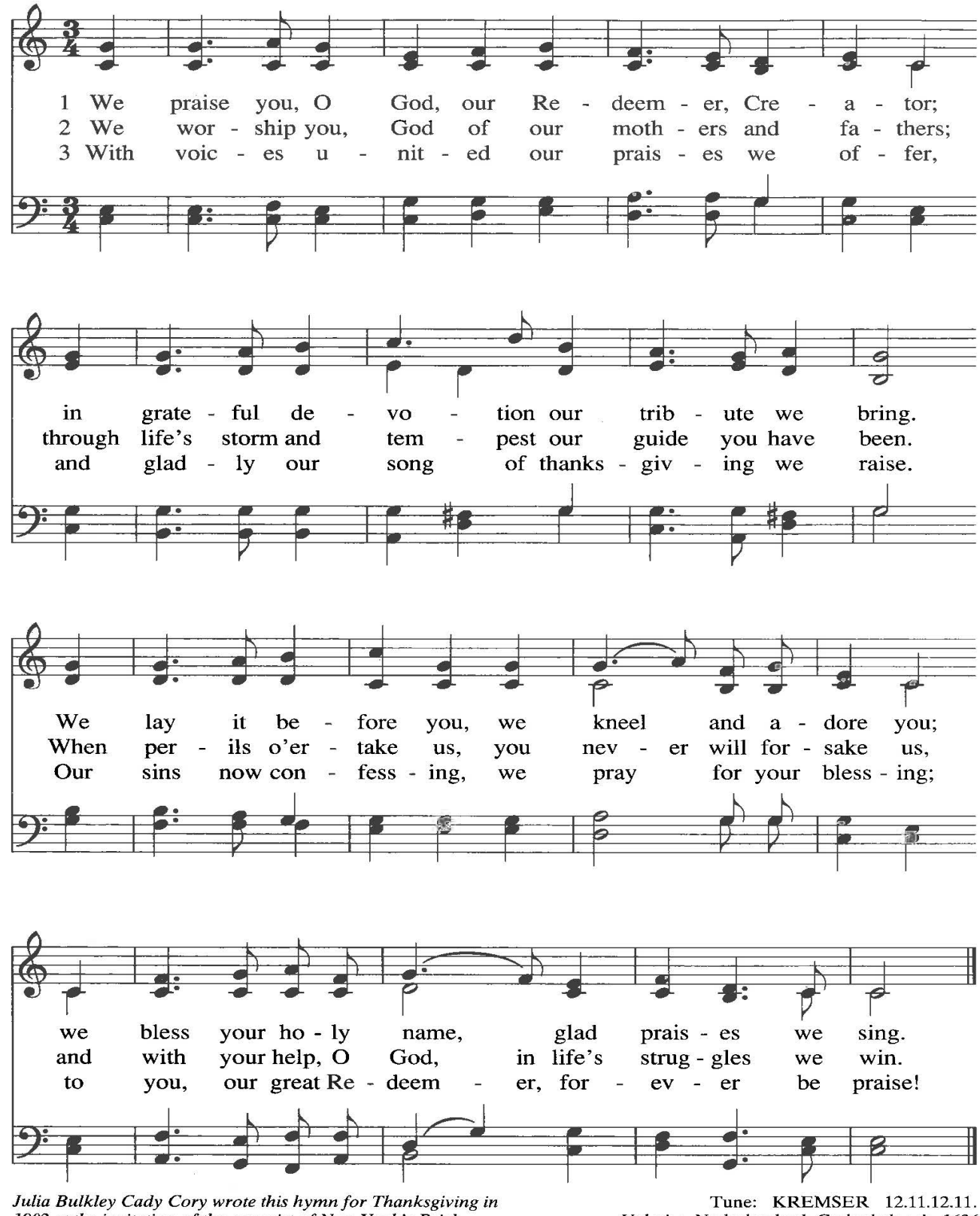
1902 at the invitation of the organist of New York's Brick Presbyterian Church who felt that the familiar words to Kremser contained too much militaristic imagery.